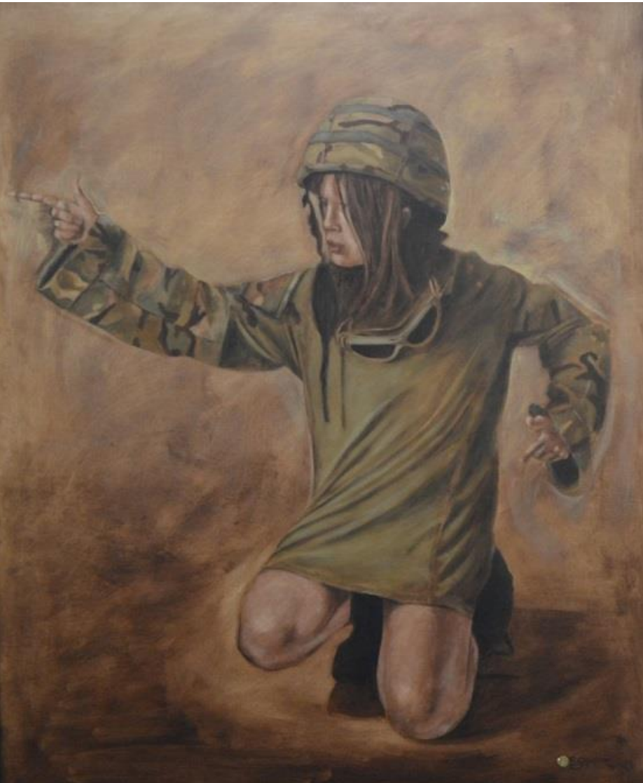
2013, Young Gun, 80x60cm, Oil on Panel