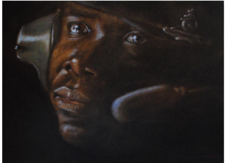
2011, The Operator, Oil on Linen National Army Museum