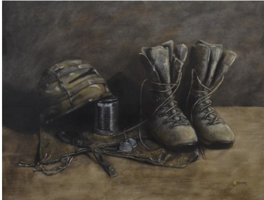
2013, Sandbag Arrangement, 80x60cm, Oil on Panel