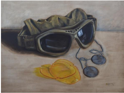
2013, Physical Vision, 80x60cm, Oil on Panel