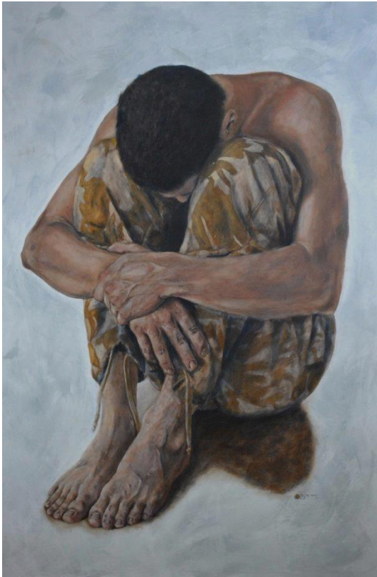
2013, Inner Sanctuary, 122x80cm, Oil on Panel