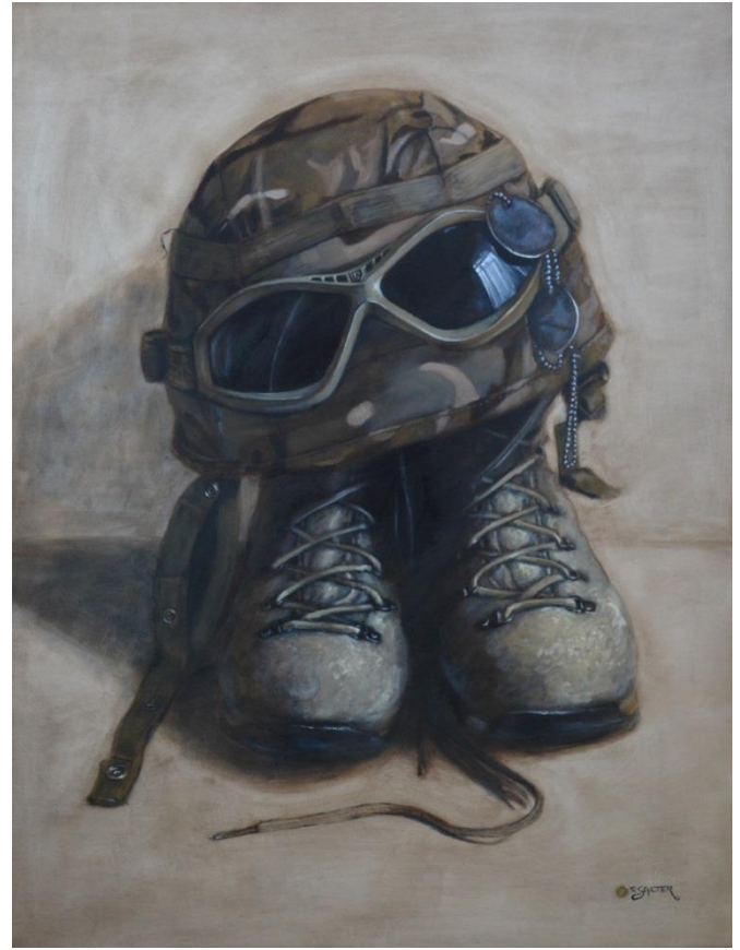
2013, Issue Kit 2D2, 80x60cm, Oil on Panel