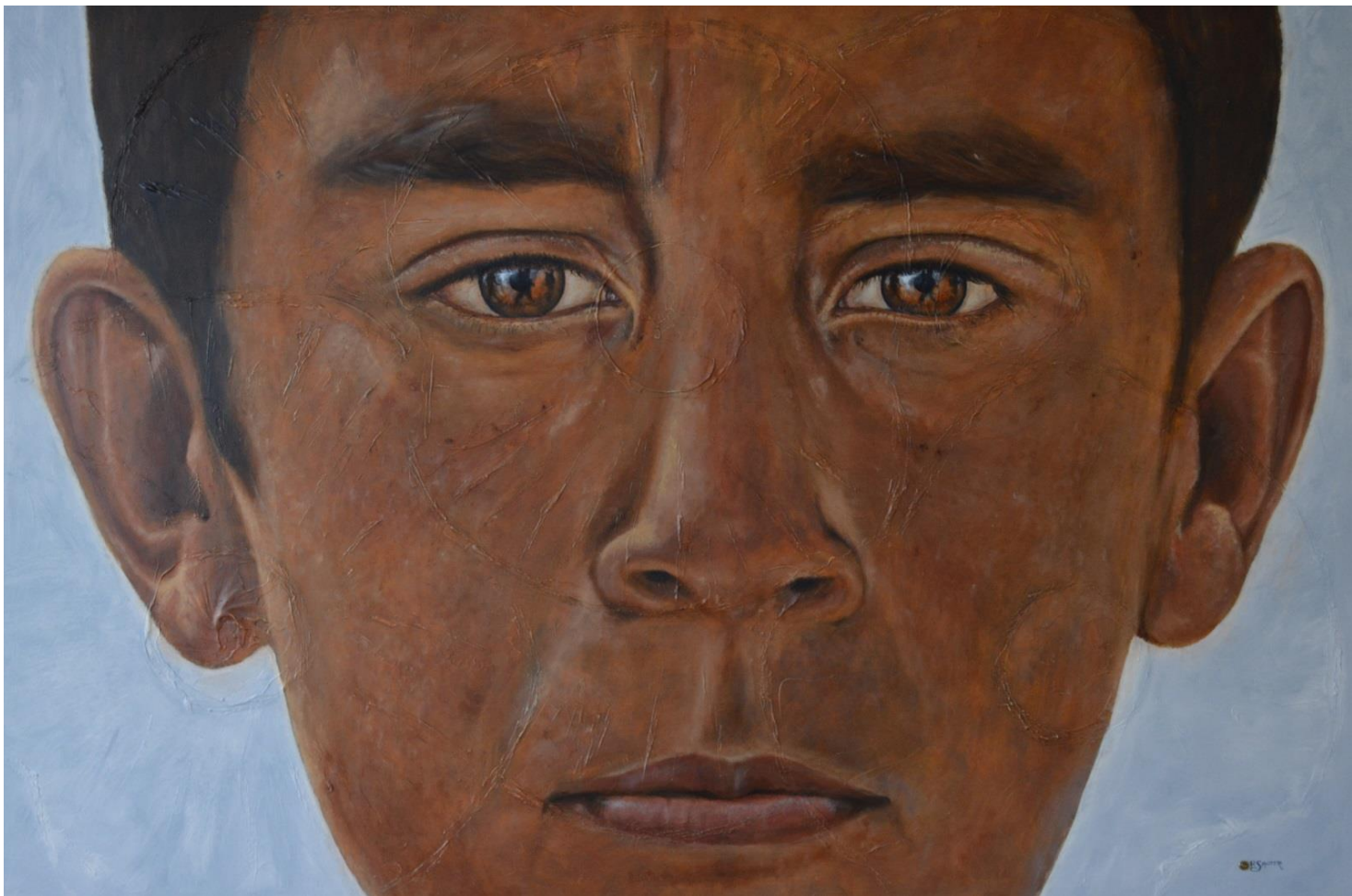
2013, One child, three soldiers, inescapable memories, 138x96cm, Oil on Panel