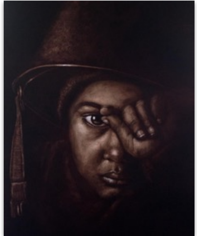
2016, Bronze Sombre II, 61x54cm, Oil on Panel

The dot in the centre of the brass donates where the rifles firing pin struck the shell to detonate.