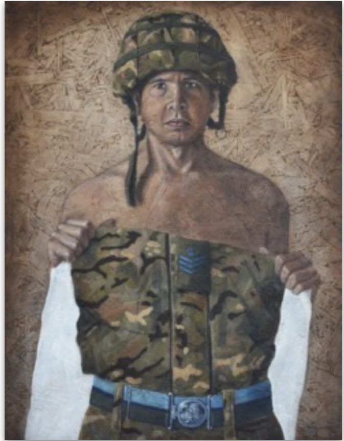
2016, Scars, 79x60cm, Oil on Panel

I carry on, Day by day, He has not gone, But now I see.